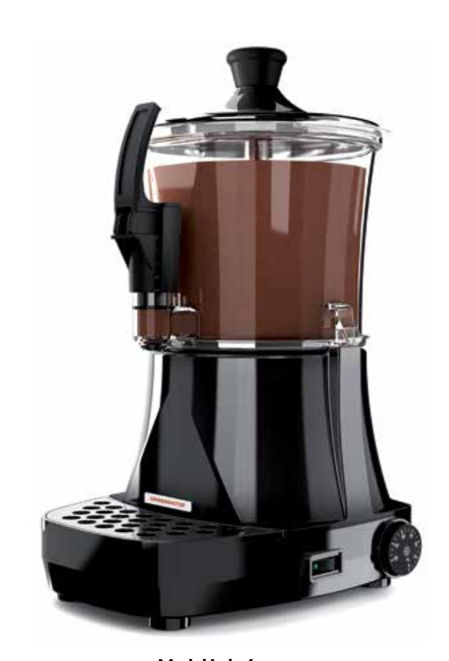
Model Lola 6